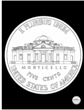
The 2006-Dated "Return to Monticello" Nickel

The announcement of the design of the obverse of the "Return to Monticello" nickel will occur in October 2005. The "Return to Monticello" nickel will be the final design in the United States Mint's Westward Journey Nickel Series™.