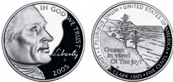
The "Ocean in View" 5-Cent Coin (Nickel)

In a conference report to Public Law 104-52 that created the United States Mint Public Enterprise Fund (PEF), Congress directed the United States Mint to report quarterly on implementation of the PEF. This report is designed to fulfill that requirement.