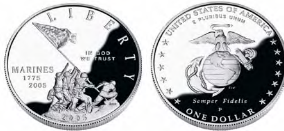
The Marine Corps 230 th Anniversary Silver Dollar