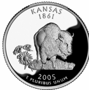
The Kansas commemorative quarter-dollar bears an image of a buffalo (the state animal), and three sunflowers (the state flower).